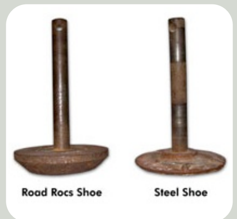
Road Rocs Shoe

RocCera ceramic inserts were initially brazed onto a standard steel shoe and placed in service on rural roads in upstate New York. Steel shoes were tested on the same roads. By the end of the season (after miles of plowing), the ceramic shoes showed little sign of wear, while the steel shoes were destroyed.